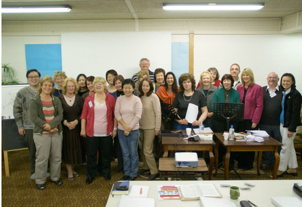
S Launceston Tasmania AUS LSM School Students with Liberty